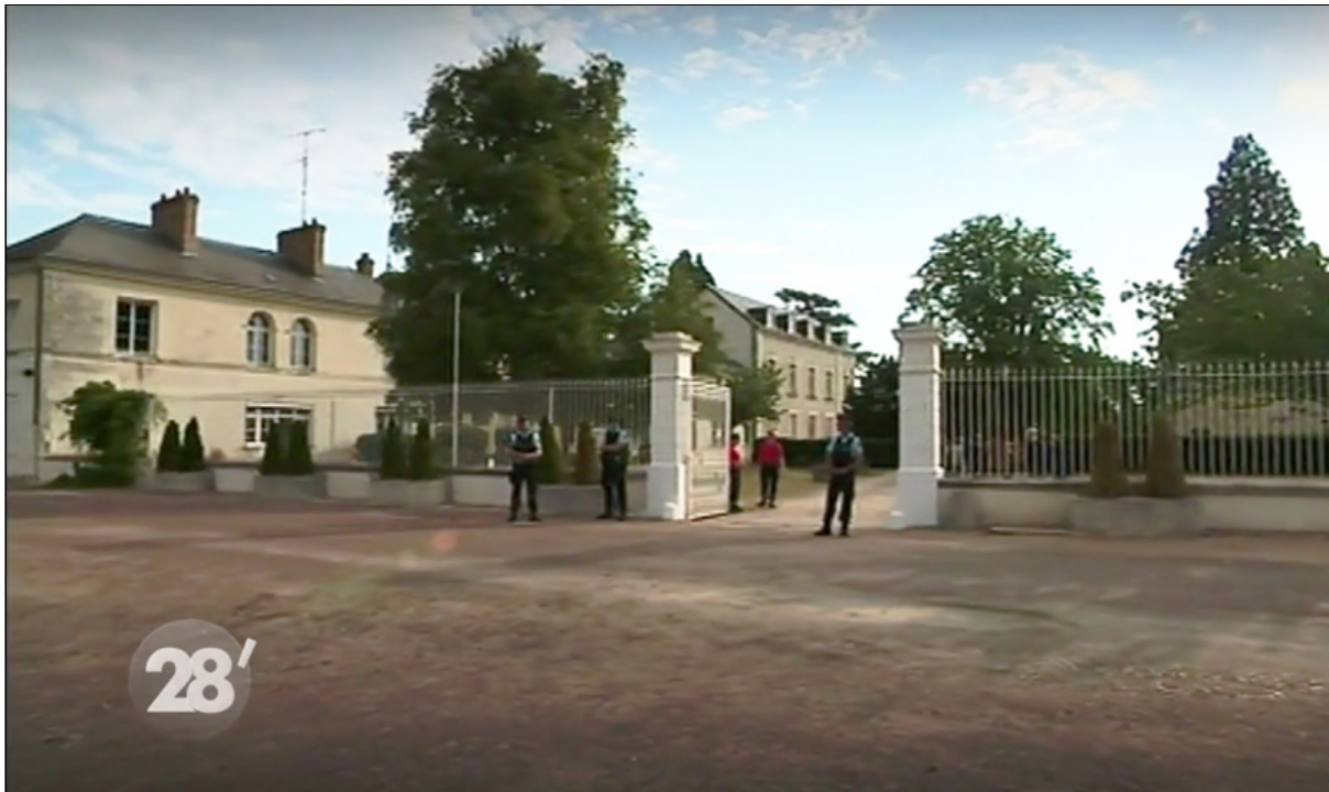
The Château de Pontourny "Center for Prevention, Integration and Citizenship," in France.

After just five months of operation, Pontourny is now empty, even though it employs 27 people, including five psychologists, a psychiatrist and nine educators, at an annual cost of €2.5 million ($2.6 million).