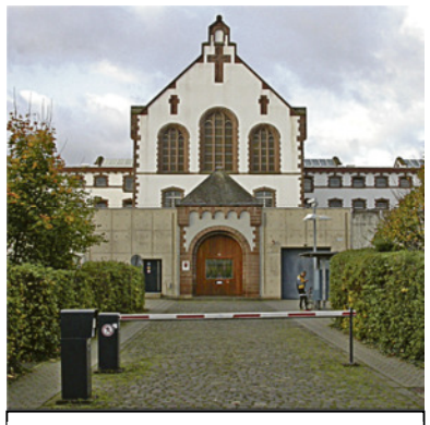
Juvenile prison Wittlich

Check your itinerary asap. The nearest airport is Frankfurt-Hahn (not to be mixed up with Frankfurt International). The next train station is in Wittlich. (In Wittlich is the youth prison, the adult prison and the justice academy, places which we probably see on Wednesday for E5, the regional colloquium, and more. This is the main reason why we choose the location BK.)